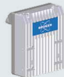
Fully integrated XFlash® detector

Sum spectrum (grey) of maps above and deconvoluted element peaks for silicon (blue) and tungsten (yellow)