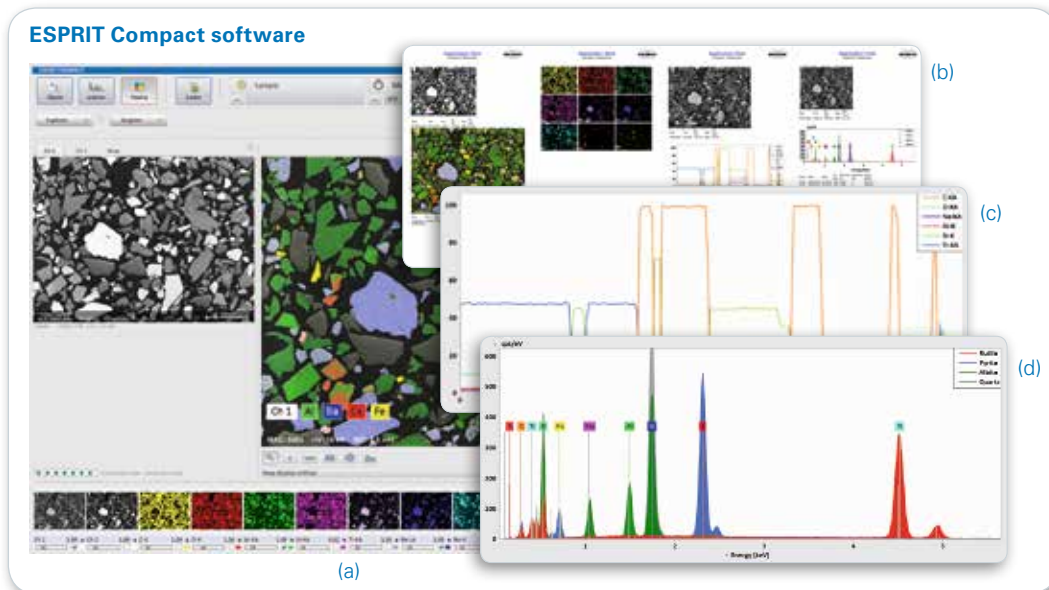
ESPRIT Compact with mapping (a), report (b), line scan (c), and spectrum (d)